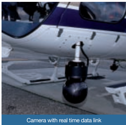
Camera with real time data link

When refinement, comfort and aesthetics are determining factors, the Ecureuil can be fitted with top-quality amenities and additional soundproofing.