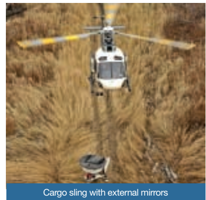
Cargo sling with external mirrors

A large array of optional equipment is available: moving map, binoculars, electrical hoist, cargo swing system, cargo sling with external mirrors, wire strike protection, floatation gear, hailers, camera with real time data link, sand prevention filters, search light, roping systems...and the list goes on.