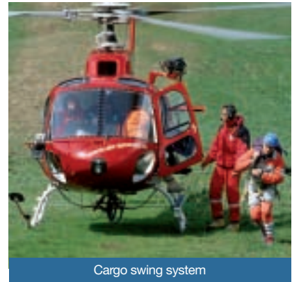
Cargo swing system

Some of the wide-ranging missions performed by the AS350 B2: