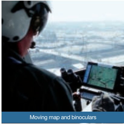
Moving map and binoculars