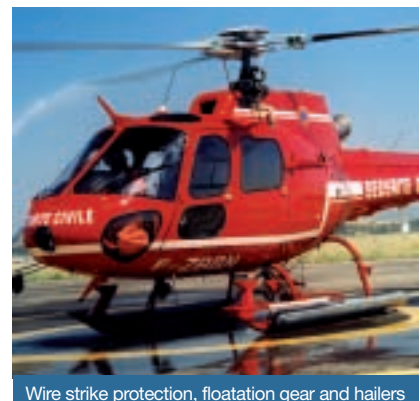
Wire strike protection, floatation gear and hailers